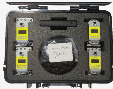
Portable set in transport casing. Can hold up to 4 units with battery pack, cables, charger and documentation