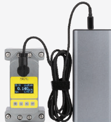
S462 powered by external power bank with connection cable A553 0156

Note: Power bank must be sourced locally due to shipping restrictions [USB-C, 20 V, min. 80 mA]